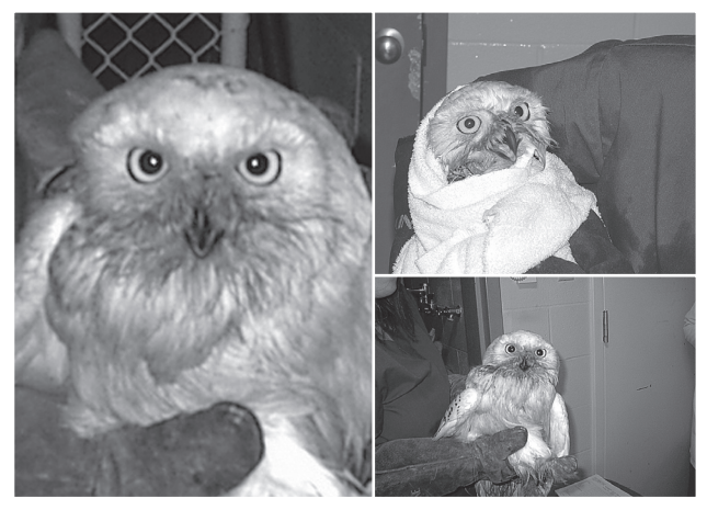
Care of an injured Snowy Owl, 2005

Contacts have been strengthened with wildlife rehabilitators and other professionals involved in the care of wildlife in the Maritimes (e.g., the Atlantic Wildlife Institute in Sackville, NB). Students in the Wildlife Conservation Technology Programme at Holland College were contacted to help correctly identify and provide species-specific insights into the patient bird population. All those involved in the project, and especially the wildlife patients, will benefit from this increased level of cooperation.