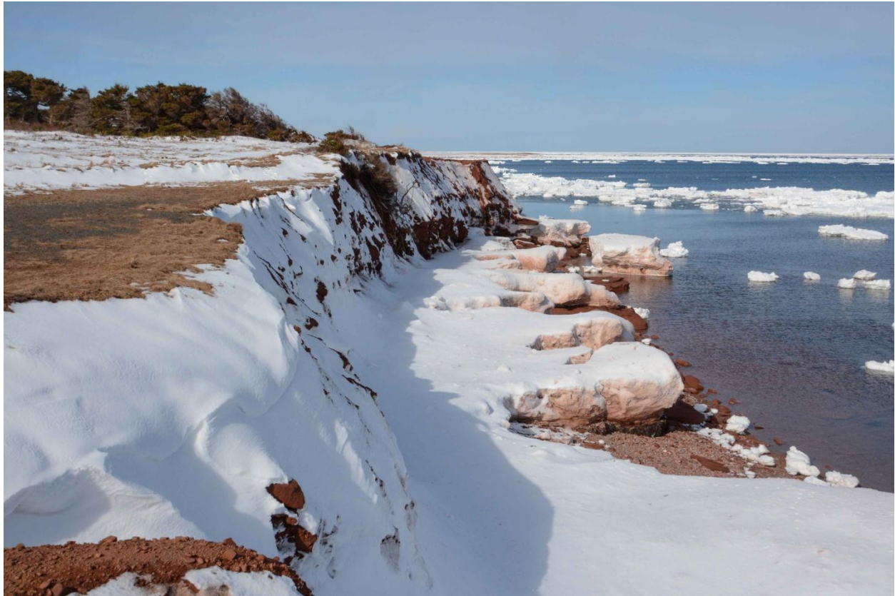
Figure 3- East Point Cliff February 2017, PEI