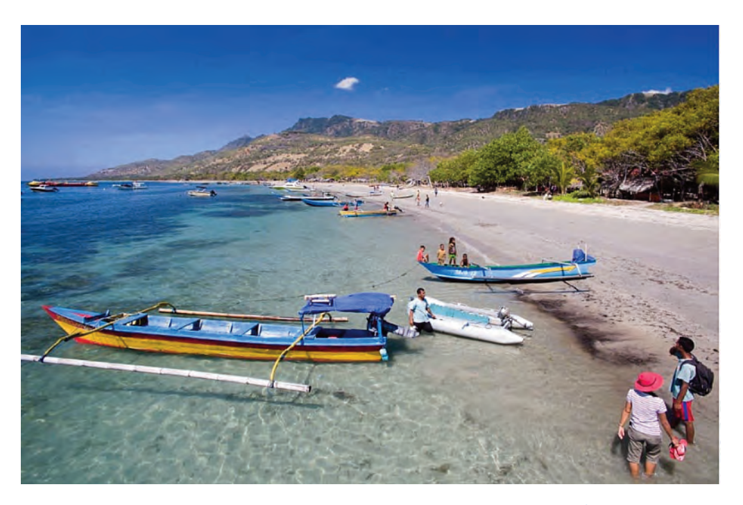
Atauro Island in Timor-Leste. Smaller and less developed islands have the highest rates of death by communicable disease and poor nutrition. Almost one half of the deaths in Timor-Leste are a result of these causes. Atauro Island tourism photo

combined with poorer access to respiratory health care means that the potential outcomes may eventually be bleaker than elsewhere.