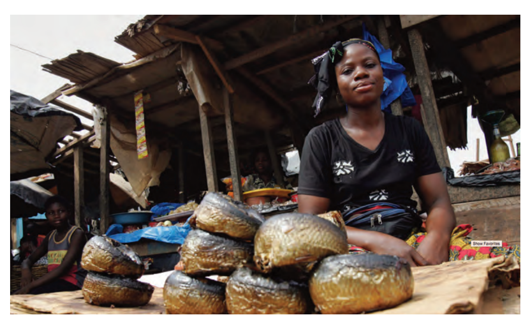
Linking agriculture and the fisheries to tourism is a driver for rural incomes in Pacific Island states.

small in land size, when the Exclusive Economic Zones are considered, small islands and archipelagos often have responsibility for a relatively massive marine area. Especially in some South Pacific island countries, these areas may have abundant fishery resources, representing a critical source of revenues. Considering the past damage from large-scale fish harvesting on fish stocks and the marine ecological environment, fishery cooperation between Hainan and other islands may encourage a greater emphasis on fish farming — a traditional strength of Asian communities.