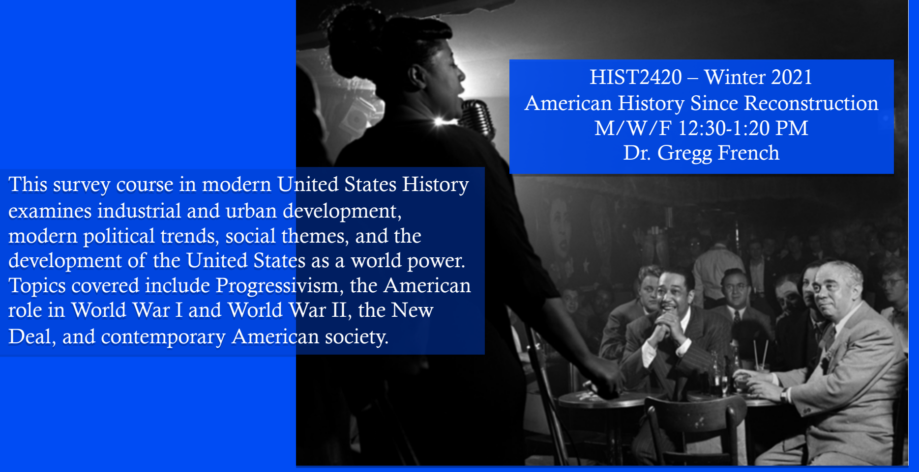
Ella Fitzgerald, Duke Ellington, Benny Goodman, Downbeat Club, 52nd St., NYC, 1948