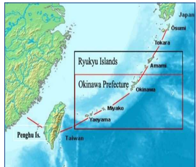
OKINAWA ISLANDS 2