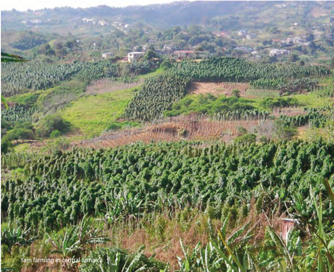
Yam farming in central Jamaica

300,000, such as Barbados, Antigua, and more recently St. Lucia, fewer people are employed in agriculture and per cent contribution to GDP has declined. However in the larger islands of the Greater Antilles — Cuba, Dominican Republic, Haiti, and Jamaica — agriculture has also declined in contribution to GDP, but remains a significant source of employment. In the Dominican Republic, agriculture declined from 21% of GDP to 5% between 2000 and 2016, yet 16% of the population are still employed in agriculture. In Haiti, the poorest country in the western hemisphere, more than 2 million people work in agriculture, which accounts for 22% of GDP. In these islands, large rural populations are dependent on agriculture for their livelihoods. The majority of households are small-scale farmers who account for the bulk of domestic food production, so the sector is critical to food security. Although these rural households are to some extent food-secure, rural populations still live in a condition of persistent rural poverty as they did a generation ago (Barker, 1993).