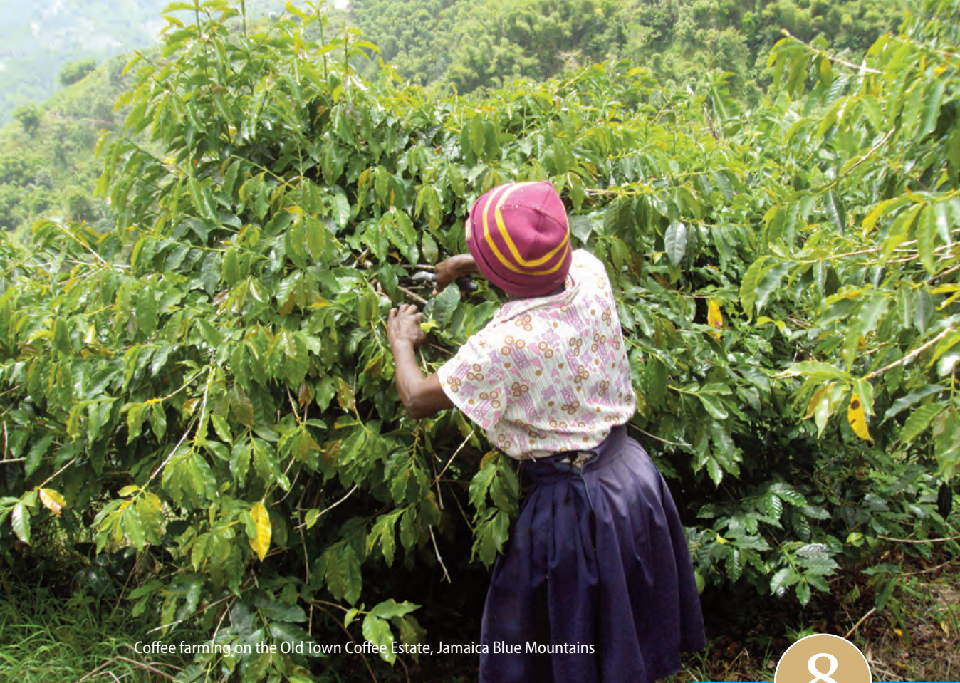
Coffee farming on the Old Town Coffee Estate, Jamaica Blue Mountains