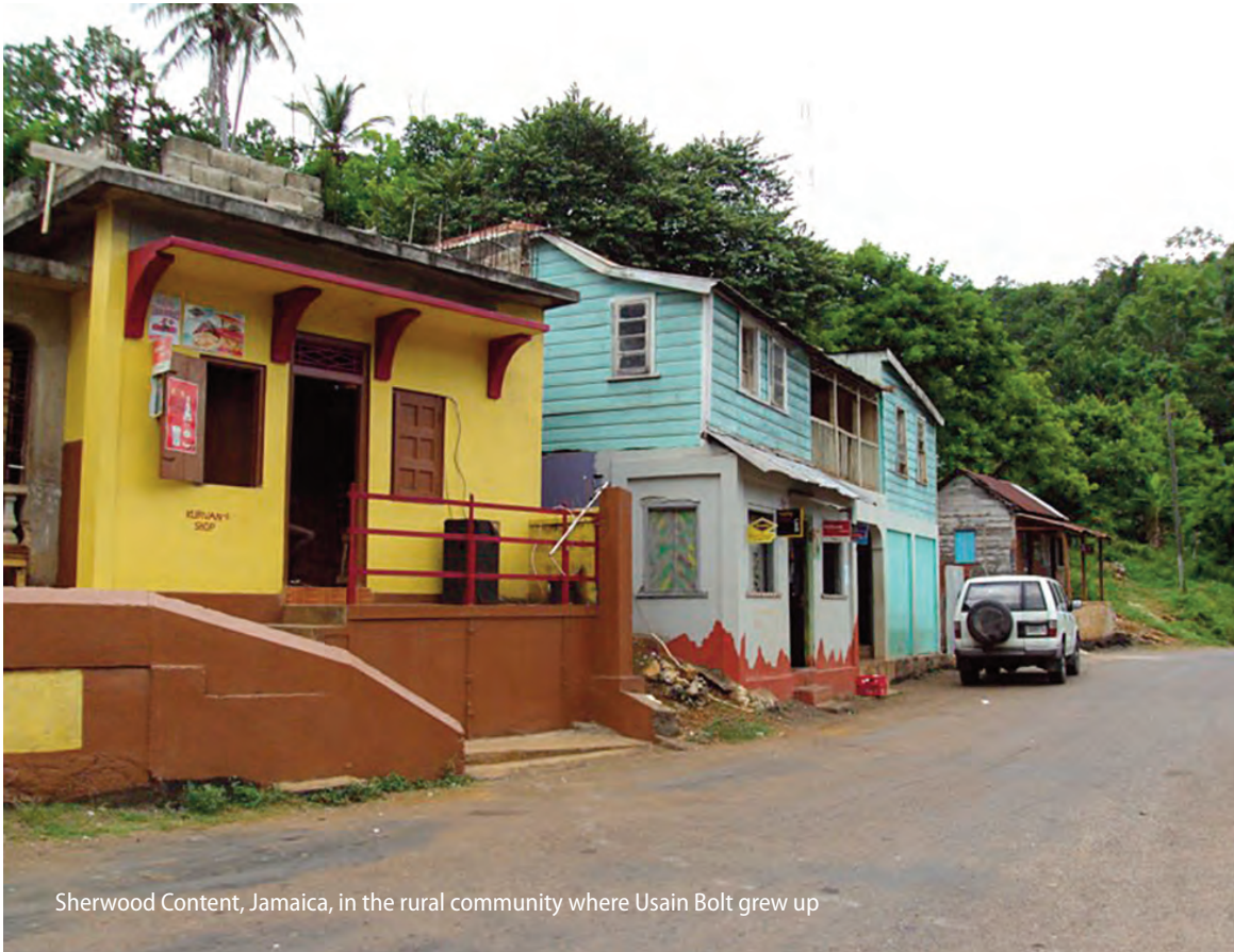
Sherwood Content, Jamaica, in the rural community where Usain Bolt grew up

Blue Mountain Coffee is world-renowned for its quality, though it is now almost entirely dependent on the Japanese market (Birthwright & Barker, 2015).