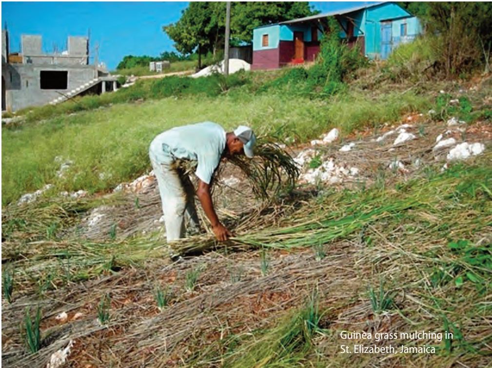
Guinea grass mulching in St. Elizabeth, Jamaica

groups within a community, as in the case of differential gender impacts (Clarke & Barker, 2012). Community vulnerability will depend on local cropping systems and social, economic, and environmental conditions, among other things. Local variability in exposure to risk from climate change and in the capacity of different communities to respond can pose huge challenges for island planners with limited financial and human resources: one size cannot fit all when formulating appropriate policies at the community level. Rhiney (2015) argues that capturing local variability and targeting geographic pockets of vulnerability is critical to policy formulation. Capacity-building and strengthening resilience may involve doing different things in different islands, and in different communities in a specific island.