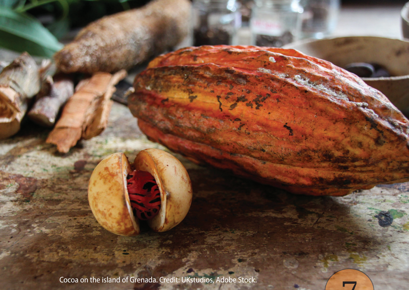
Cocoa on the island of Grenada.