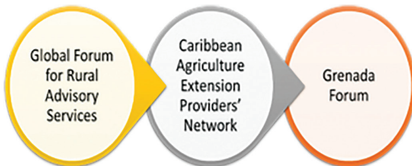
Figure 4: RAS Community Linkages.

The Food and Agriculture Organization (FAO) is one of the first specialized agencies of the United Nations and has been in existence for over 70 years. As of 2016, FAO constituted 194 member countries, one member organization and two associate members (OECD/FAO 2016), and currently works in 130 countries worldwide. The main focus of the organization encompasses “nutrition, food and agriculture which also include fisheries, marine products, forestry and primary forestry products.” Its work addresses issues along the entire food system from production to consumption and embraces almost every country in the world (OECD/FAO 2016). Similar to IFAD and GFRAS, FAO targets rural populations through its programs and projects. The FAO was established as early as 1945, a period when the need for emphasis on nutrition as a solution to health issues and the impetus to find solutions to the myriad of