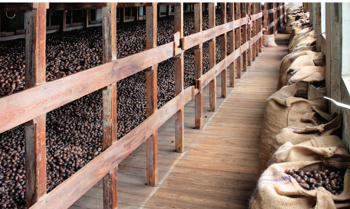
Nutmeg drying at a Grenada Co-op.

intended to improve the income and welfare of farmers and other agriculture practitioners and entrepreneurs.