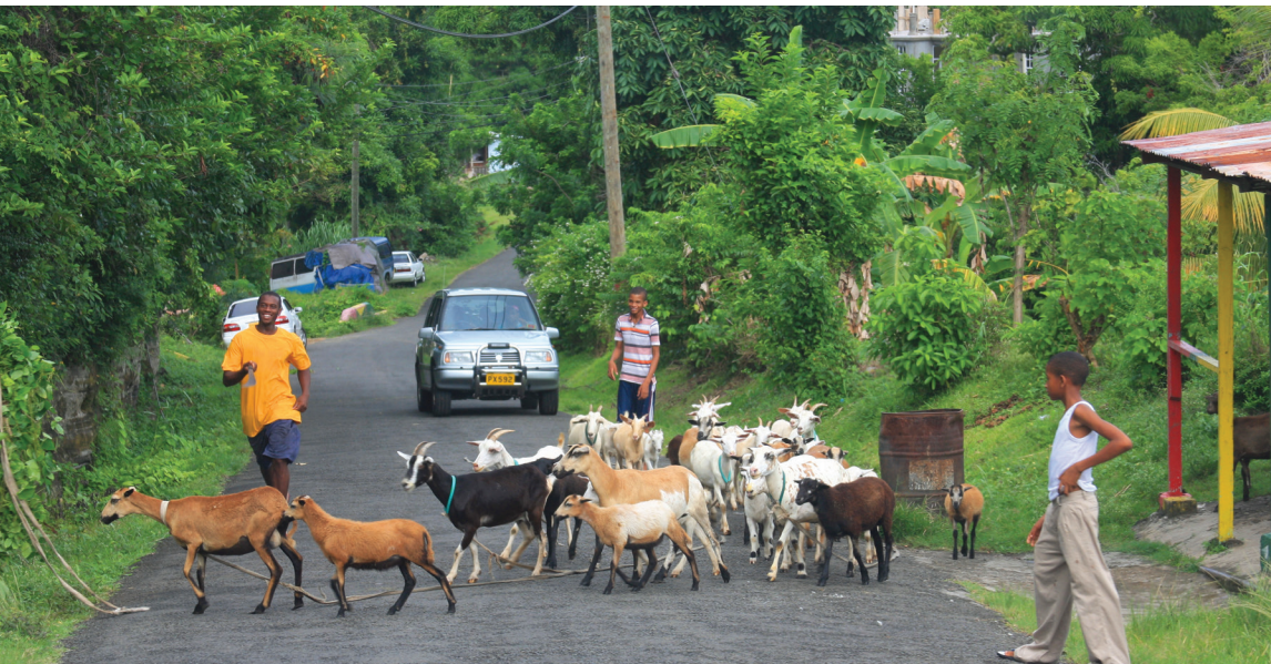
Small ruminant herd, Bathway, Grenada.

vironmental conservation and transboundary diseases support by upgrading the existing quarantine system (FAO, 2016).