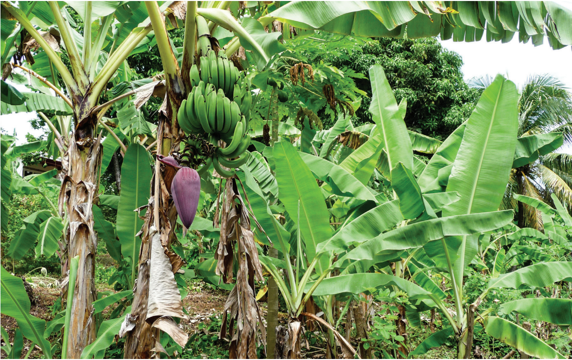
Banana plants, flower, and fruit, Grenada.

component. Emphasis is now placed on ensuring that the necessary capacity is developed through extension advisory services to support the success of SAEP. IFAD believed that this approach will contribute to enhancing public extension delivery services as well as ensuring sustenance by building the capacity of extension assistants to replace the number of officers carded for retirement from the service (IFAD, 2017).