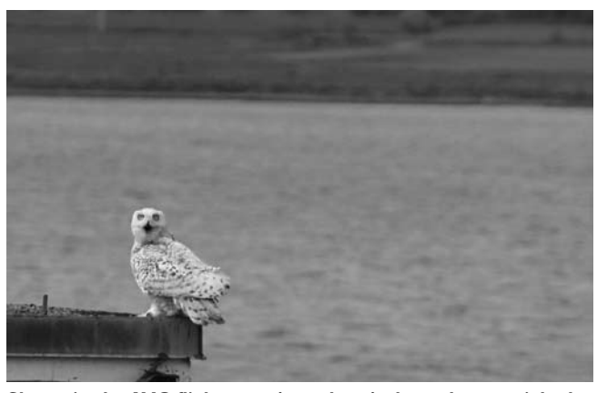
Shown in the AVC flight cage (top photo), the owl was weighed and banded (middle photo, Dr. Marion Desmarchelier with student Kelly de Haan) for future identification, prior to release (bottom photo, after release).

Donations to support the programme are most welcome. (Please see box on page 8 for donation information.)