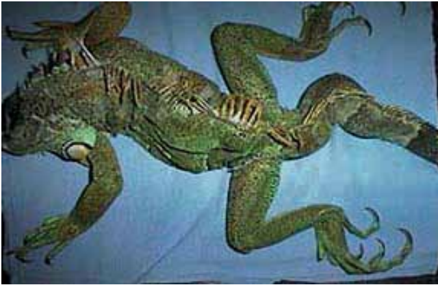
Severe metabolic bone disease in a Green iguana, the result of prolonged improper diet. This problem is common in iguanas and other reptiles.

It is estimated that 50-90% of reptiles die during their first year of captivity. Caretakers don't realize what will be required; they rely on inaccurate information; and they can't afford the necessary equipment and veterinary care. Environmental and nutritional problems are by far the main reason for veterinary consultations in reptiles. This is associated with tremendous animal suffering.