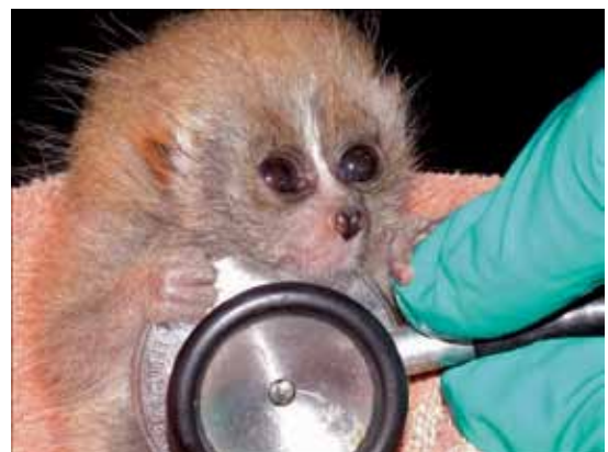
Pygmy slow loris (weight 28 gram), part of a group that was seized during a smuggling attempt

The percentage of wild caught animals in the Canadian pet market appears to be decreasing. The exception is the marine fish trade where the vast majority of fish