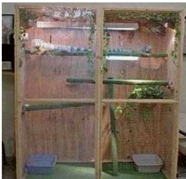
Providing proper housing is challenging and expensive—a young Green iguana (left) can grow to larger than 1.5 meters in 5 to 6 years (right).