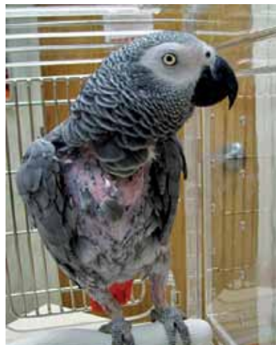
Bird with feather destructive behaviour

Psittacine birds (parrots, cockatiels, etc.) are very social, highly intelligent, and long-lived (50–60 years). They can develop significant behaviour problems (aggression, self-destructive behaviours) due to an unchallenging life (boredom) or improper nutritional or environmental conditions, or at sexual maturity.