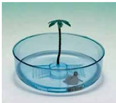
Turtle in a barren and, unfortunately, more typical environment