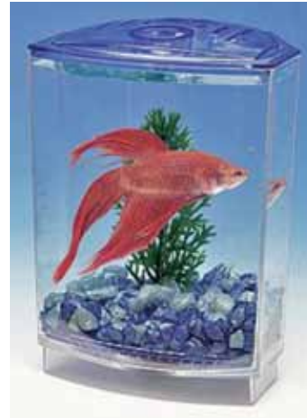
Betta fish in housing that is much too small