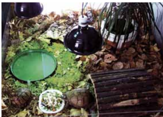
Box turtles in an appropriately complex and varied environment