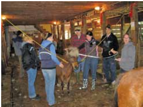
AVC Students at April 2010 vaccination and deworming clinic at Handibear Hills

These two service projects provide consistent basic and preventive health care to incoming and resident horses at the PEI Equine Retirement Society, Inc.