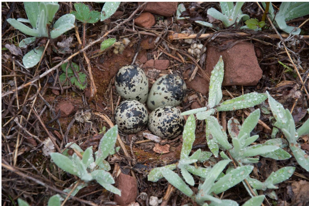
Figure 3- Killdeer Eggs in nest, Argyle Shore