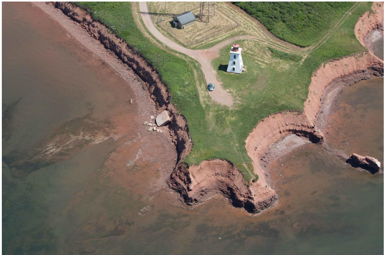
Figure 1 Cape Egmont Lighthouse, Shoreline Erosion

This summary is produced by the UPEI Climate Lab for the month of April, 2018. Data is reported for 31 climate stations in the province as shown on Table 1. The annual summaries of PEI climate data for 2014, 2015, 2016 and 2017 and the monthly summaries are now posted on the UPEI Climate Lab Website. ( http://projects.upei.ca/climate/research/ ).