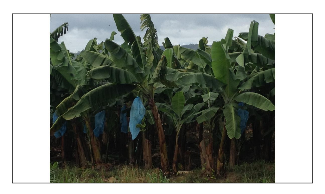
14A. A heavy reliance on imports is clearly not a sustainable approach to long-term food security for the SIDS. But why has there been such a major shift away from local food production? Globalization has been a huge driver of the change. Traditional agricultural systems in many places have been replaced by less diverse cash crops and livestock production, often with unsustainable land-use practices.