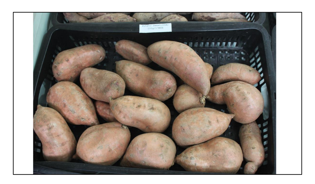
3. Well, here's what I found on that trip: chicken from Brazil, wheat and rice from India, sweet potatoes from the United States and apples from France, and water - if you can believe it - from Norway